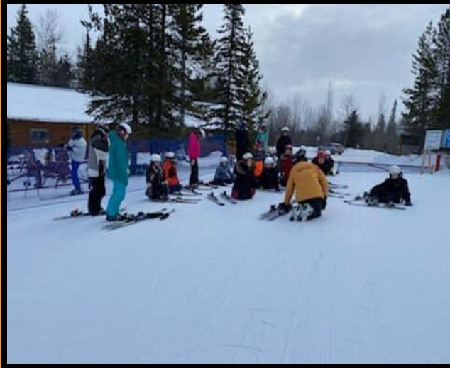
“WORSLEY SKI TRIP”

“The mission of our school community is to educate, inspire and empower all students.”